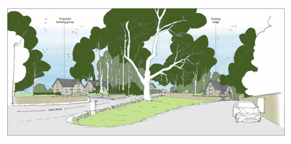
Figure 3: Proposed context of Building Group