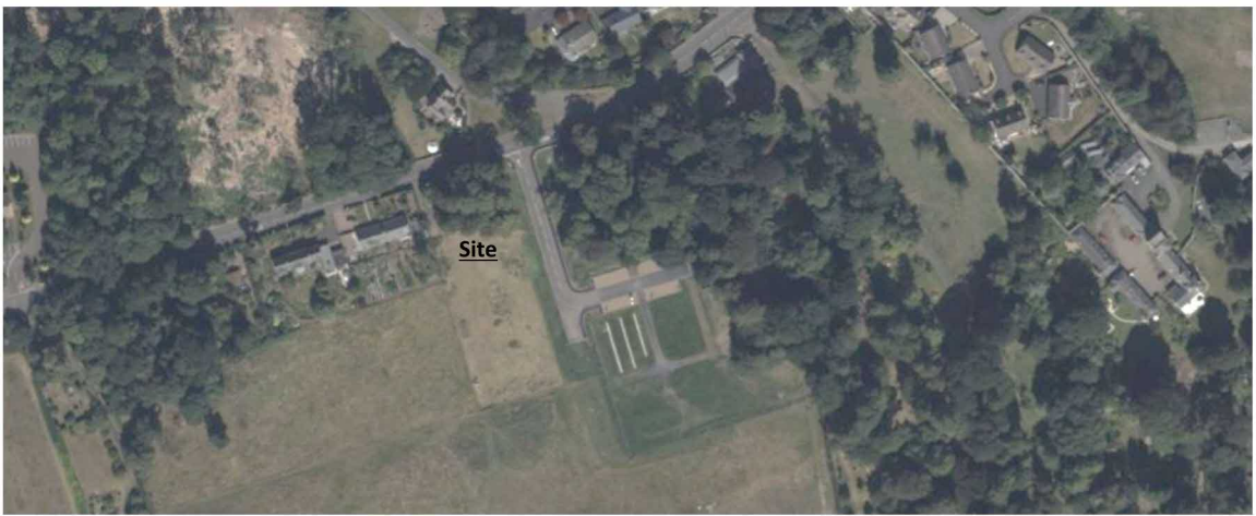
Figure 4: Aerial View of Site

Proposals for renewable energy development, including proposals for wind energy development, will be permitted if they accord with the objectives and requirements of policy ED9 on renewable energy development.