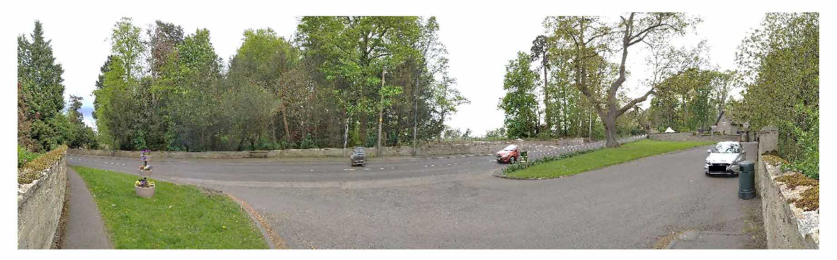
Figure 2: Existing outlook to the site and the Lees Landscape Feature