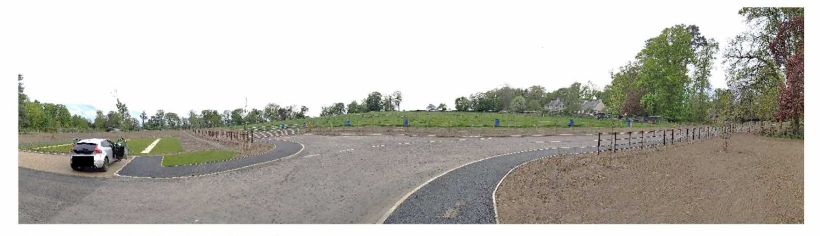
Figure 5: Site works related to 19/01562/FUL